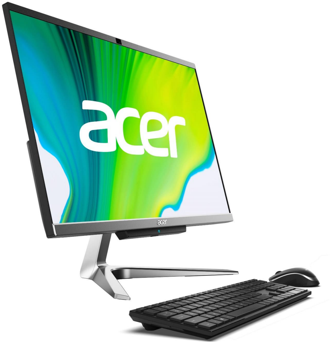
ALL-IN-ONE DESKTOP COMPUTER